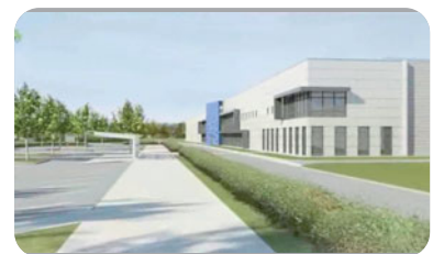
View from the car park