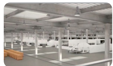
Processing and packing room